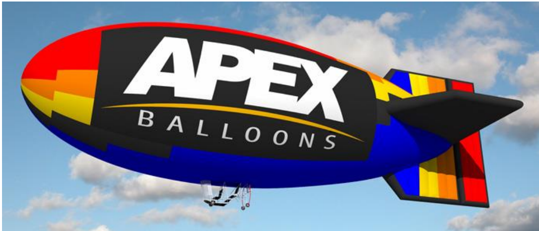
APEX thermal airship.

APEX noted that, “A hot air airship may be the ideal platform for applications requiring low-level station-keeping with minimal environmental disturbance.....Helium blimps have a narrow weight range to maintain, cannot carry heavy payloads without awkward ballasting and re-ballasting, and must maintain a forward airspeed to generate enough dynamic lift to remain airborne when flying ‘heavy.’”