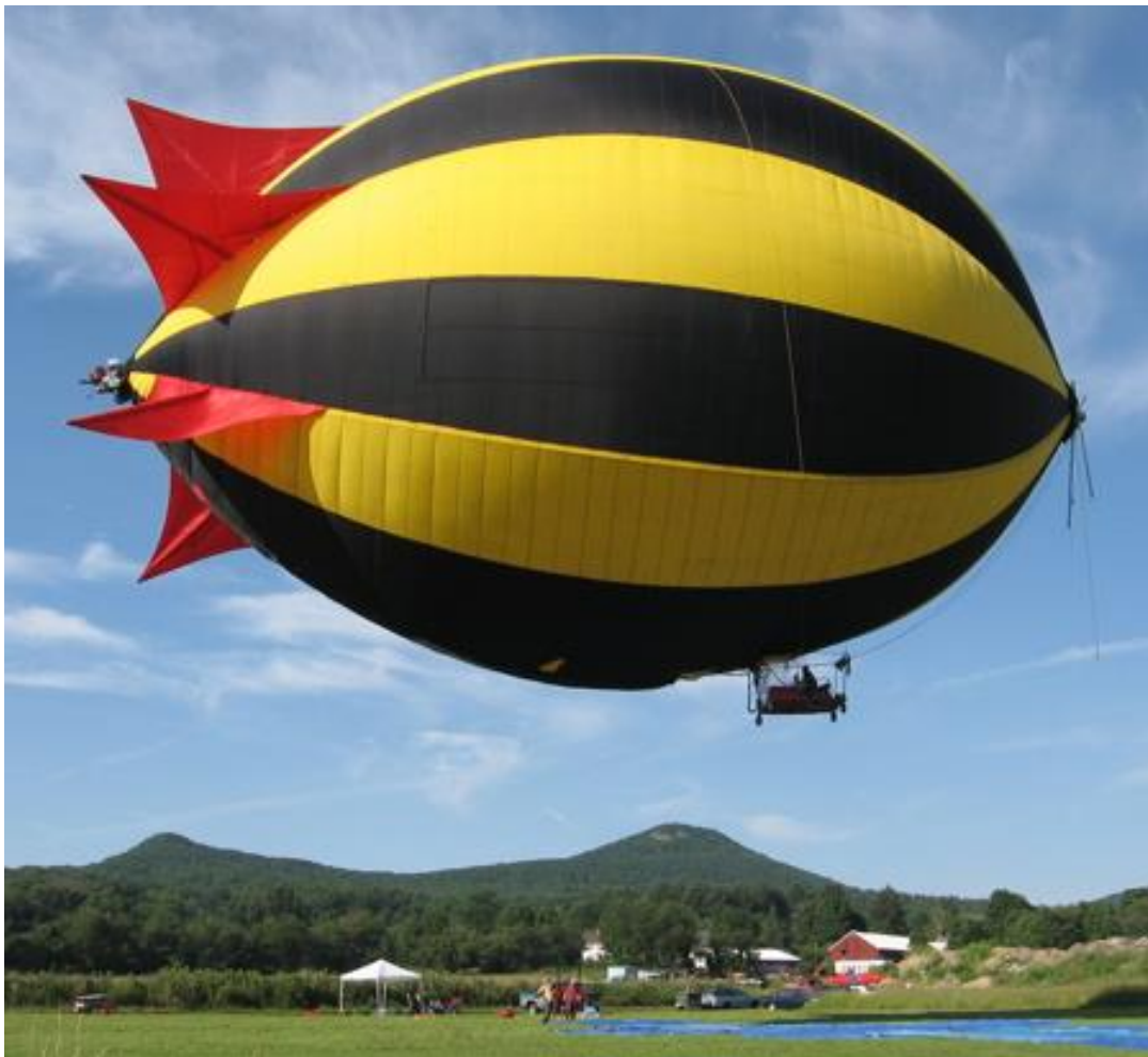
Personal Blimp "Airship Alberto."