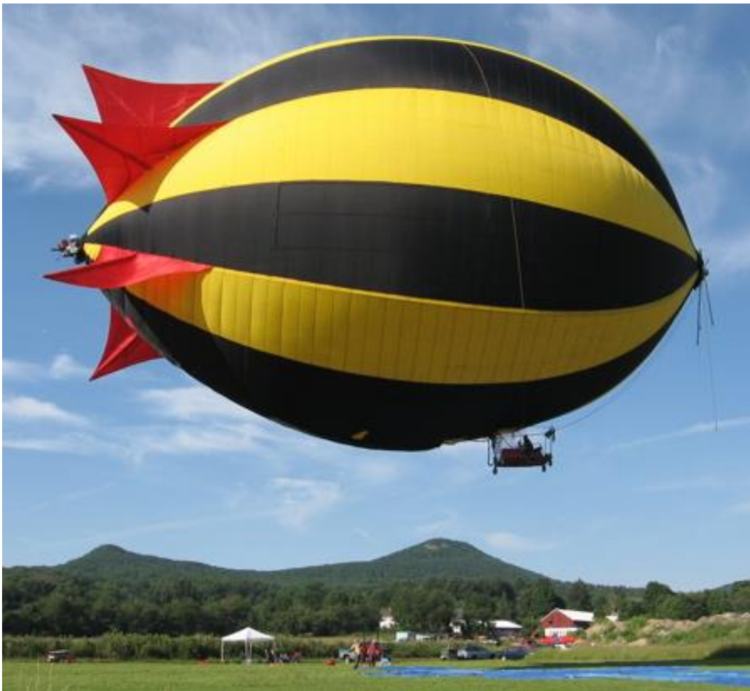
Personal Blimp "Airship Alberto."