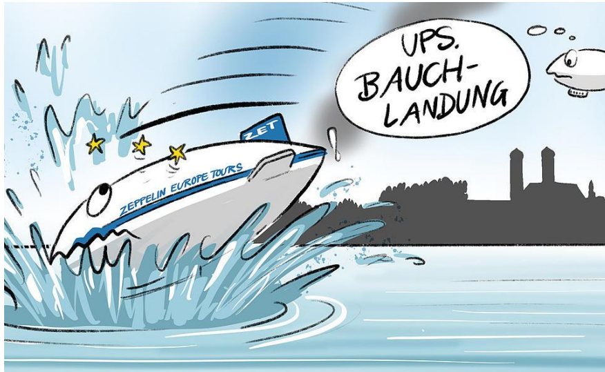
Oops. Belly flop.

double the size of those that can be seen over Lake Constance every day and take 45 passengers instead of 14. But nothing comes of it: Zeppelin Europe Tours GmbH is dissolved. What remains is the story of an adventurous search for investors and Wolfgang von Zeppelin's dream that the vision will become reality again.”