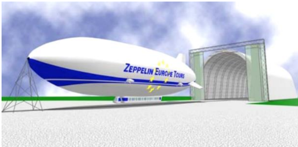
The ZET airship and its hanger.

Like the Zeppelin NT, the ZET airship has a diesel-electric power system. Propulsion is provided by four flank-mounted vectored thrust propulsors plus one vectored thrust propulsor at the stern. Also at the stern is one fixed lateral thruster.