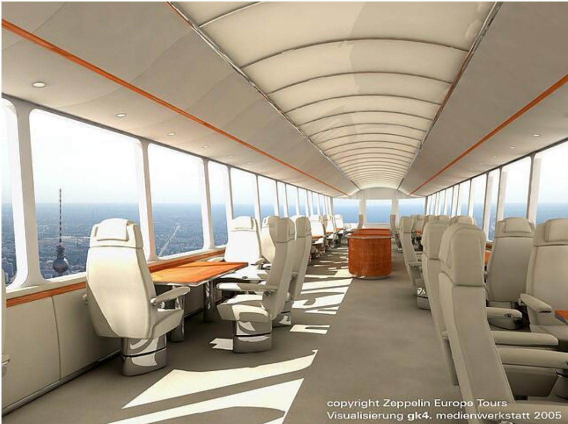
The gondola can seat 45 passengers in 14 seating groups, with a panoramic bar at the stern.