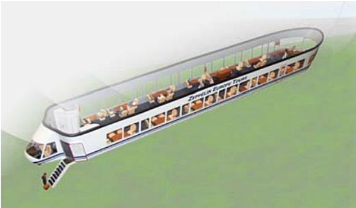
The passengers enter and exit the gondola via stairs on both sides of the cockpit.