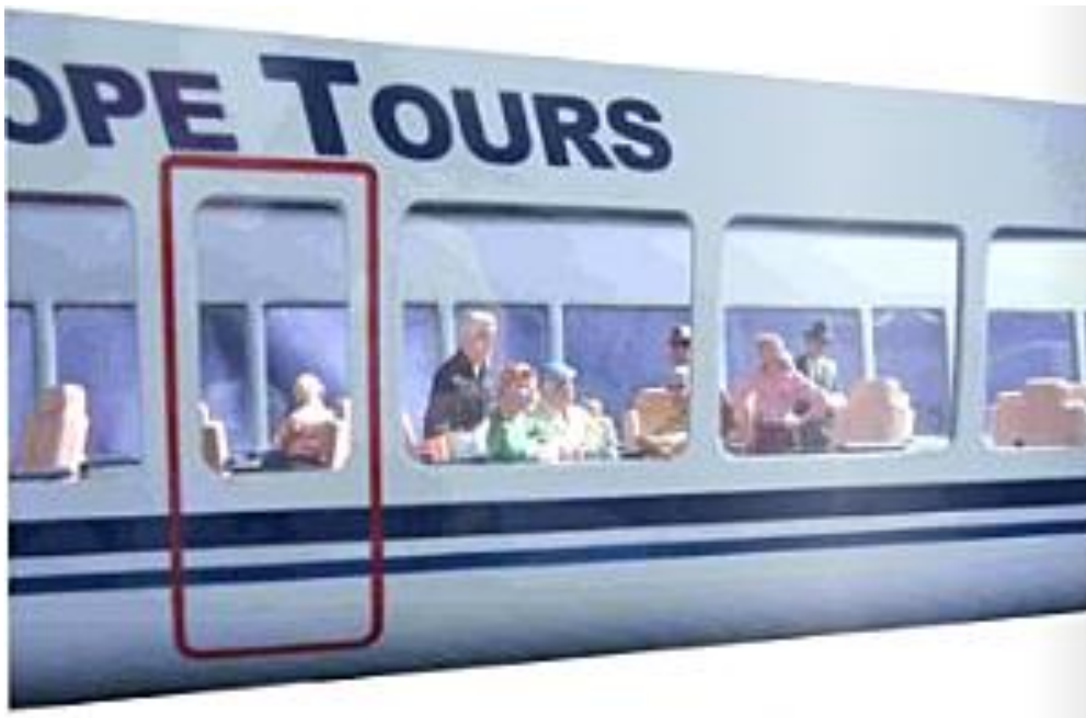
Interior and exterior views of the passenger gondola. Windows can be opened in flight for photography.