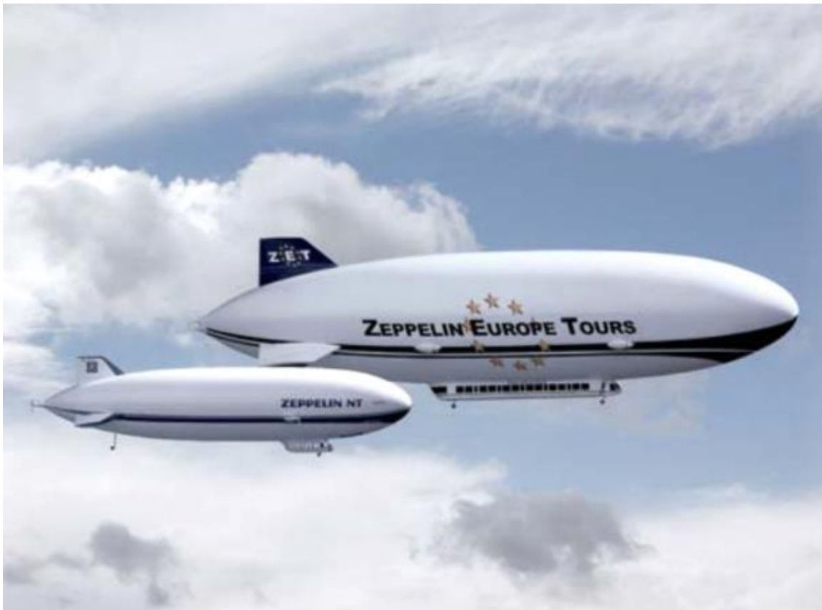
Scale comparison of the Zeppelin ZET and the NT.

The ZET airship was a scale-up of the basic design of the 12-passenger, semi-rigid Zeppelin NT Type LZ N07, which first flew in September 1997. Since then, several Zeppelin NTs have been in regular operation, primarily for short tourist flights.