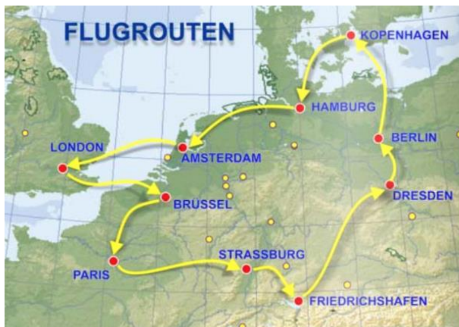
Example 20-day European zeppelin tour route.

The tour operator planned to offer 20-day round-trip zeppelin tours of Europe with 10 destinations.