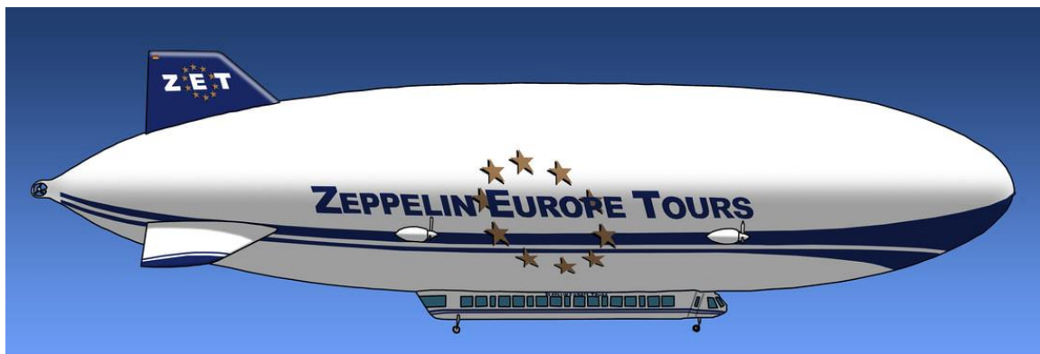
Profile view of the ZET airship.