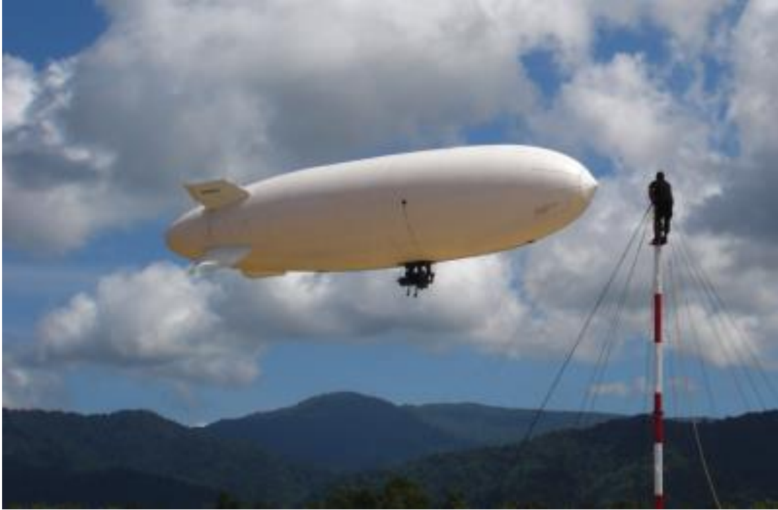
Aeros 40D at a mobile mooring mast.