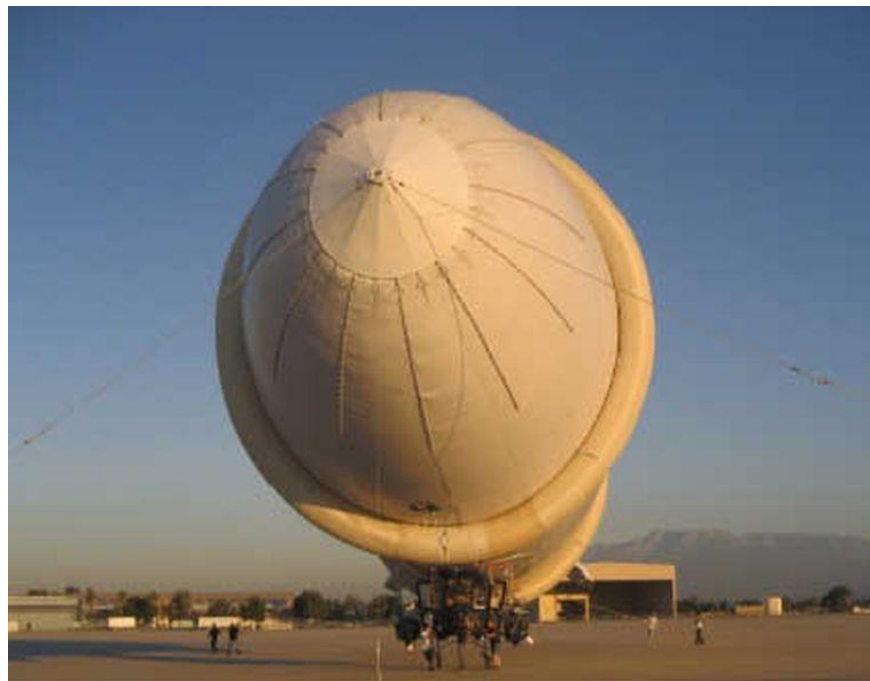
The variable buoyancy Aeros 40D-COSH with two inflatable collars that were controlled by the on-board, flight-weight, prototype COSH system.

Under a follow-on DARPA contract issued in October 2007, Aeros modified an Aeros 40D Sky Dragon by installing two inflatable collars that were controlled by an on-board, flight-weight, prototype COSH system. Aeros announced 17 July 2008 that a successful flight test of the modified Aeros 40D validated the operation of COSH. Aeros CEO Igor Pasternak explained, "We want to demonstrate we can change the static heaviness enough in a short time to be operationally acceptable."