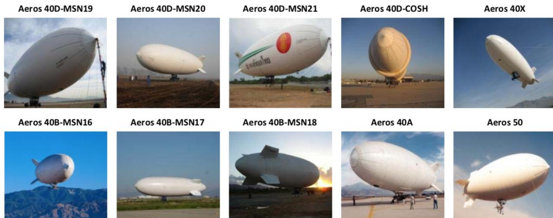
Evolution from the Aeros 50 to the Aeros 40 Sky Dragons.

The Aeros website is here: http://aeroscraft.com