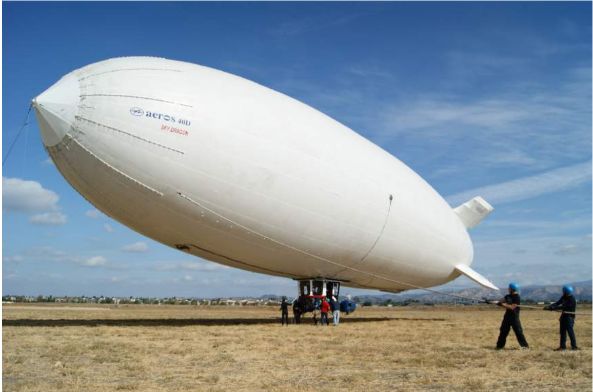
Aeros 40D.