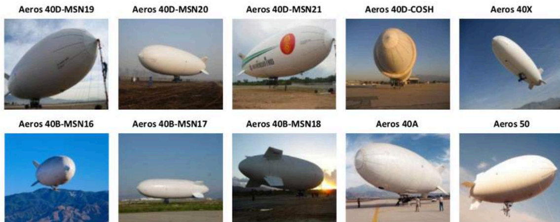
Evolution from the Aeros 50 to the Aeros 40 Sky Dragons.

The Aeros website is here: http://aeroscraft.com