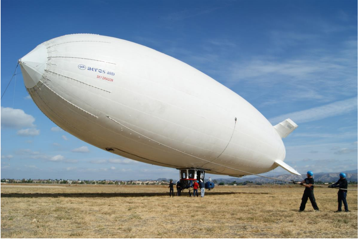
Aeros 40D.