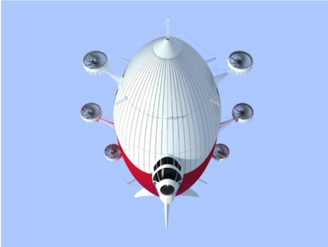
30 January 2010