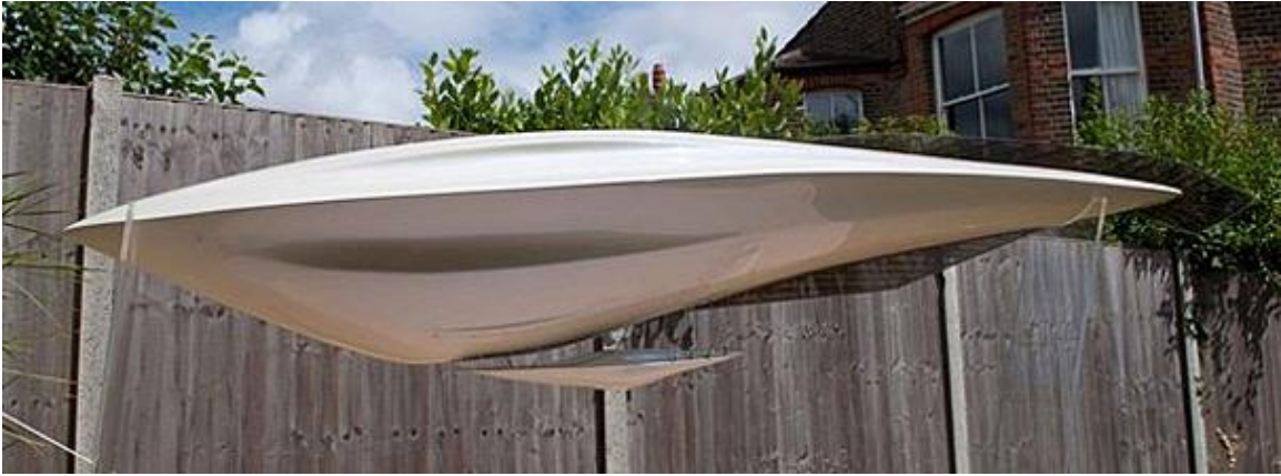
Eunoia model (above) and rendering (below) from a similar perspective.