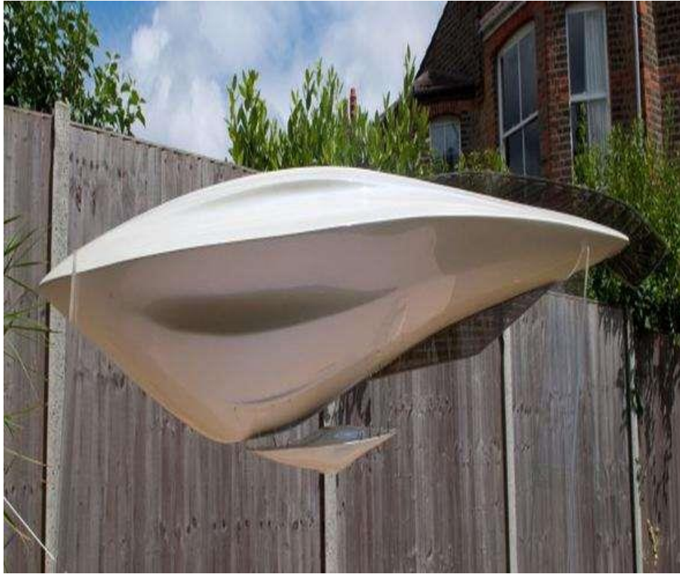
Eunoia model (above) and rendering (below) from a similar perspective.