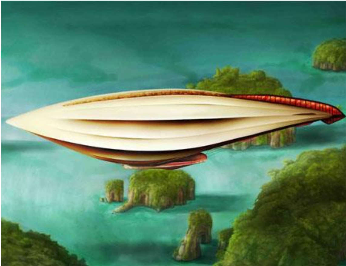
Rendering of Eunoia in flight, viewed from above.

The airship has different venues for enjoying the surroundings: a suspended viewing capsule, a sundeck spread across the top of the hull, and a viewing room in the nose. The prototype is designed for eight passengers, but , with improved technologies, Tzortzi believes the design can be scaled to hold up to 60 passengers.