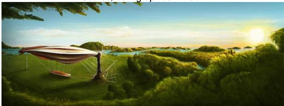
Rendering of Eunoia moored in the countryside.