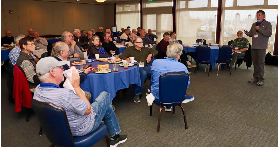
Good turnout for the 146 th Lyncean meeting.