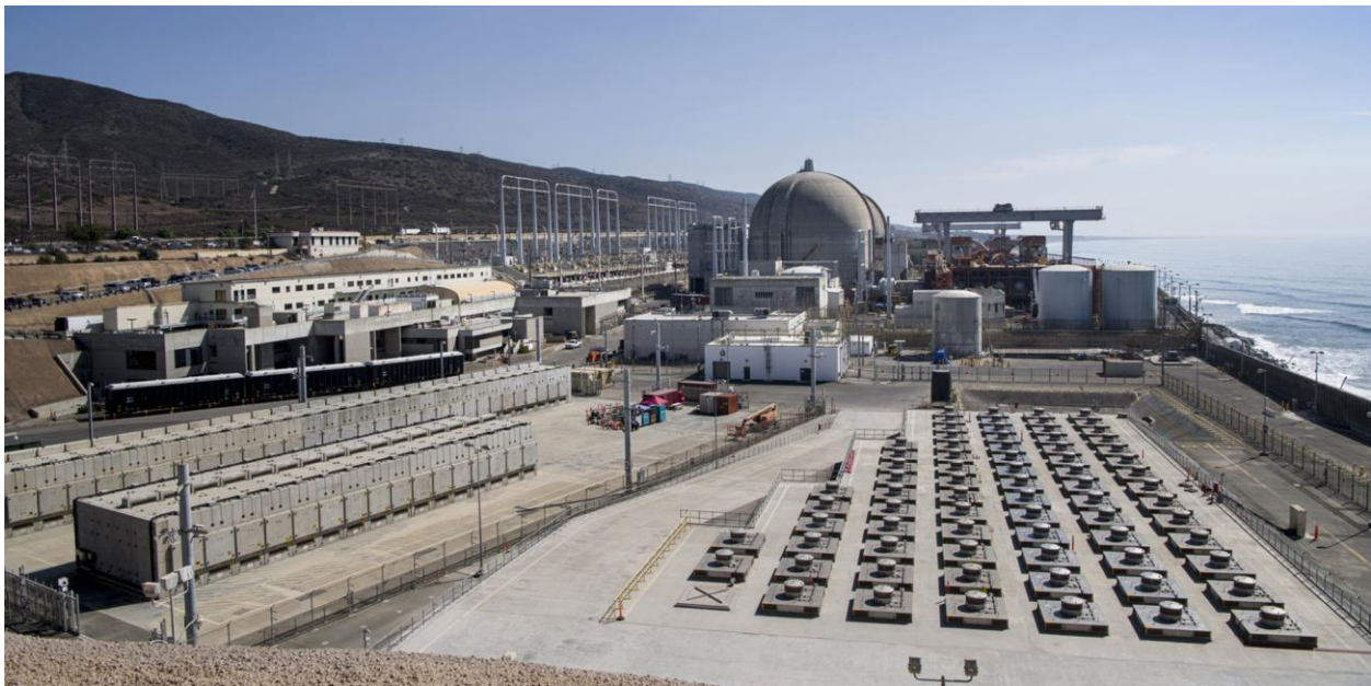
San Onofre 2 & 3 with dry spent fuel storage facility in the foreground.

Topic: San Onofre Nuclear Generating Station (SONGS) Decommissioning Status and the Storage of Spent Nuclear Fuel